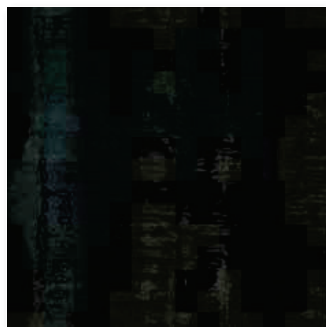
DETROIT ANTRACITA 59,6x59,6cm