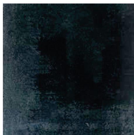
DETROIT OCÉANO 59,6x59,6cm